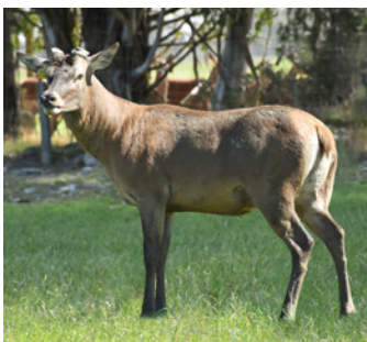
Shown at 3 years

As shown below, his impressive SA2 velvet at 3 years was 7.2 kg and he cut an additional 4 kg of regrowth. A massive total of 11.3 kg of velvet at 3 years of age. Big Geoff is a well performing sire with a great nature.