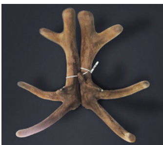
Shown at 3 years

Big Geoff is an imposing stag within the herd. Although, we only purchased him in 2017, we are looking forward to his growth and velvet attributes coming to fruition.