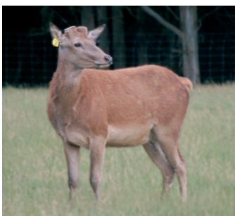
Shown at 2 years