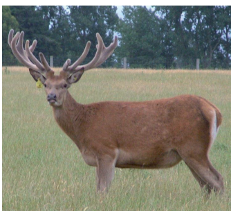
Shown at 2 years