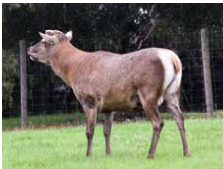
Shown at 7 years

Big Geoff is an imposing stag within the herd. He has a great nature and is an all round great performer.