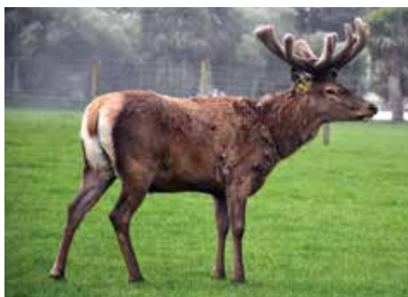
Shown at 7 years