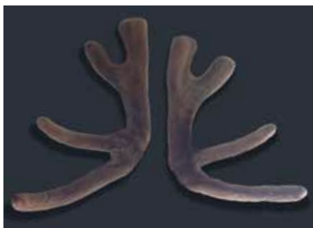
Shown at 2 years