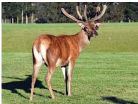
Shown at 3 years

Heinek is an exciting venison stag with excellent growth rate and conception date measures.