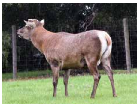
Shown at 7 years

Big Geoff is an imposing stag within the herd. He has a great nature and is an all round great performer.