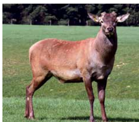
Shown at 3 years