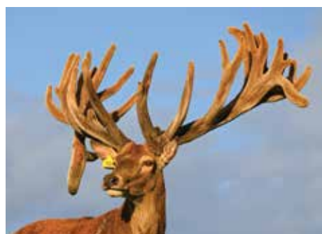
Shown at 3 years